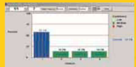
Instantly see your class's response and measure their comprehension.

VISUAL TECHNOLOGIES CORPORATION www.visualtec.com 1620 Burnet Avenue Syracuse, NY 13206 (315) 423-2000 tel (315) 423-0004 fax contact@visualtec.com