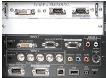
Full array of connections: just connect & project.