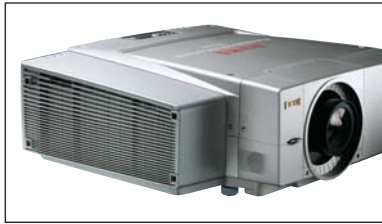
Optional smoke filter cartridge for use in highly polluted air.

Range of wide angle and telephoto lenses are available to satisfy a variety of projection requirements.