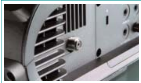
Built-In TV Tuner