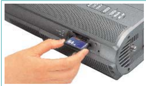
Three Memory Card Slots