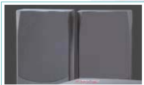
Optional Wireless Speakers