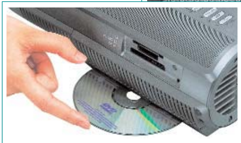
Built-in DVD Player